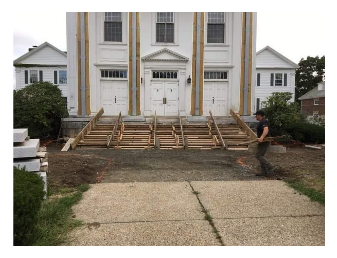
September 21, 2022 – Concrete poured, next steps for landing and granite on the way!