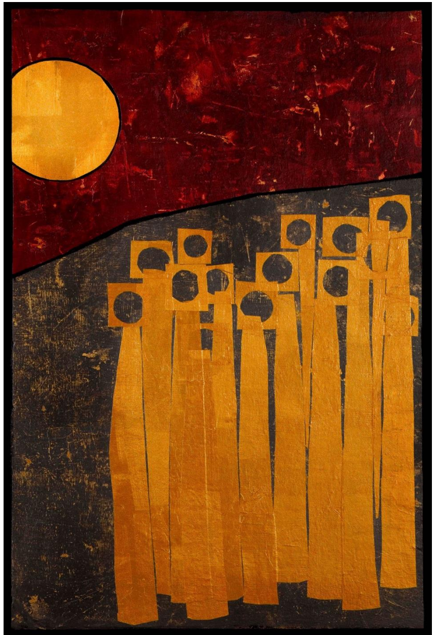
A Gathering of Spirits

For those who journey still with us in the shadows of awareness, in the crevices of memory, in the landscape of our dreams, this is a benediction.