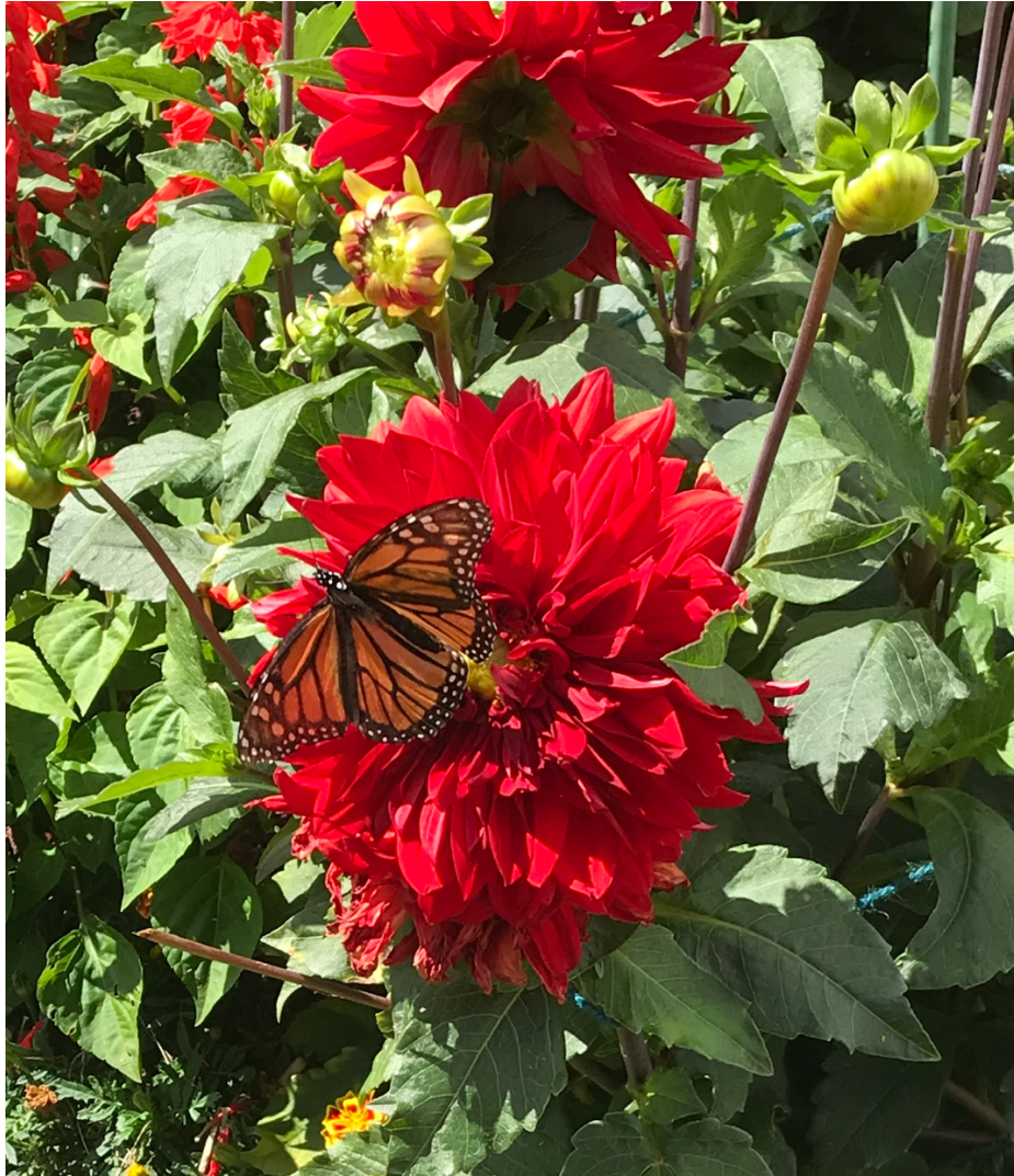
Figure 1 Clif's dahlias

Transition Edition 13 (for whenever you are so led to pause, reflect, and pray)