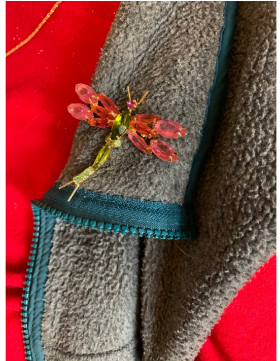
Figure 3 Marty's dragonfly pin

For the transitions that are hard for me to bear, grant me the strength to be vulnerable and seek loving accompaniment.