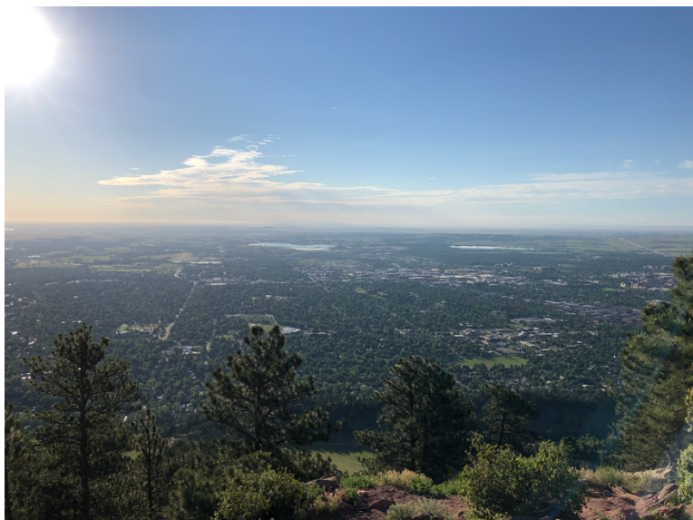
Figure 4, Mount Sanitas (near Boulder)

And forgive us our sins as we forgive those who sin against us. And lead us not into temptation, but deliver us from evil. For yours is the kingdom, and the power, and the glory forever. Amen.