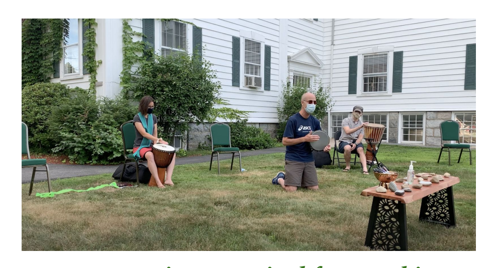
~ Reservations Required for Worship! ~ Preregister to attend at the following link: www.fbcneedham.org/worship-ministries

We are delighted to creatively navigate this interesting moment in our lives of faith. Just a word of anticipation, this worship experience will not be traditional! Due to evidence that suggests group singing and collective responses to be unsafe, we will be experimenting with other forms of praise - drumming, streamers, clapping, etc. We trust that our praise, in whatever form it takes, will be glorifying and pleasing to God so long as we are also committed to the forms of praise God most cares about - care and justice for our neighbors (Isaiah 58, Amos 5:21-24). And in keeping with our care for you, we will continue to mail out and post online (www.fbcneedham.org) our At-Home Worship Resources.