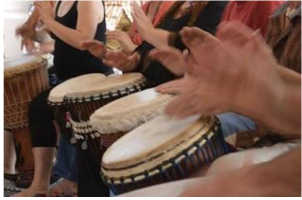
Images: Outdoor worship space, Trinity Presbyterian Church (Charlotte, NC.); Drummers together (Humble Drum.)

We are excited to conduct a trial worship experience outdoors on the lawn of First Baptist Church for the first four Thursday evenings of July at 6:00pm (July 2nd, July 9th, July 16th & July 23rd).* We are delighted to creatively navigate this interesting moment in our lives of faith. Just a word of anticipation, this worship experience will not be traditional! Due to evidence that suggests group singing and collective responses to be unsafe, we will be experimenting with other forms of praise - drumming, streamers, clapping, etc. We trust that our praise, in whatever form it takes, will be glorifying and pleasing to God so long as we are also committed to the forms of praise God most cares about - care and justice for our neighbors (Isaiah 58, Amos 5:21-24). And in keeping with our care for you, we will continue to mail out and post online ( www.fbcneedham.org ) our At-Home Worship Resources, and will continue to reserve Sunday mornings for our Community Calls of Caring.